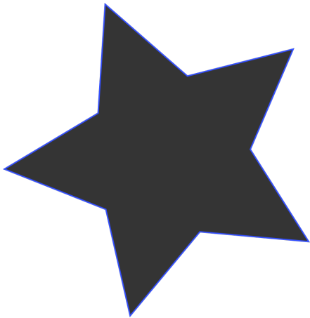
Figure 2: A sample star graphic (PNG format).